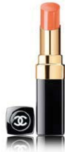
▲ CHANEL Hydrating, brilliant and as melt-away as a balm, Chanel's 'Rouge Coco Shine' becomes fluid on contact with the lips. Available in a palette of semi-transparent or deeper shades. www.chanel.com