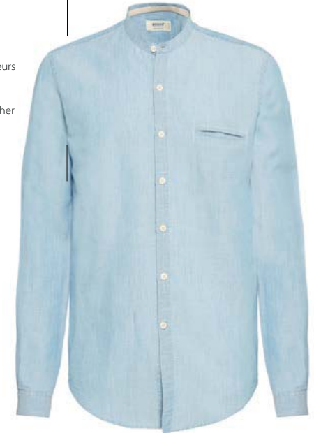
▲ BOGGI MILANO Custom-fit linen and cotton shirt with a Korean collar. Made from an ultra-light stretch fabric for added comfort, its contemporary light cut adds a touch of chic to the wardrobes of stylish, fashion-conscious gents. www.boggi.com