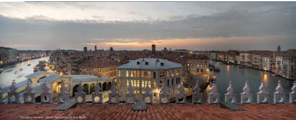
Fondaco Terrace

Palladio and Cipriani Hotels. You'll be pleasantly surprised by their elegant green spaces and trees. In the sestiere of Cannaregio, the garden of the Hotel Dei Dogi deserves to be explored and photographed. The garden was created in the 17th century to host rare botanical collections and boasts a number of magnificent species that bloom year round.