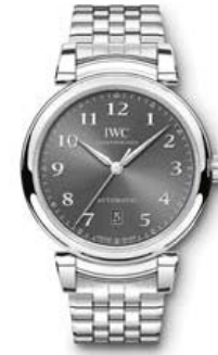
◀ IWC SCHAFFHAUSEN With its linear dial, this 'Da Vinci Automatic' watch is the ideal accessory for connoisseurs of simple elegance. Available with an ardoise dial and a steel strap or an argenté dial with a black leather alligator strap. www.iwc.com