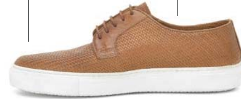
▶ FRATELLI ROSSETTI Platform derby made from soft braided barrel dyed calfskin with personalized rubber sole. www.fratellirossetti.com