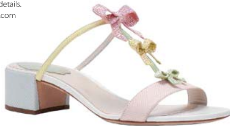
◀ RENÉ CAOVIlla Multi-coloured Karung leather sandal, decorated with three pastel-coloured rhinestone bows. Its low heel is covered in blue Karung leather. www.renecaovilla.com