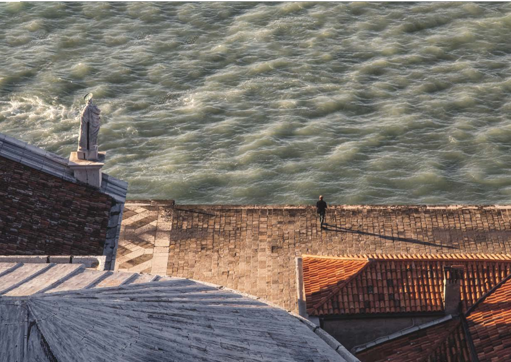
Buildings, monuments and urban spaces are juxtaposed against the blueprints of the city. Photo: Riccardo De Cal from "Dream of Venice Architecture" (Bella Figura Publications, USA)