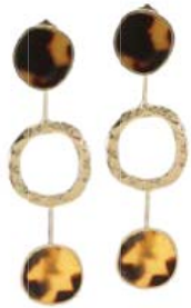
▲ MAX MARA These eye-catching drop earrings with a clip fastening are enhanced by metal geometric elements and inset resin details. it.maxmara.com

With the arrival of summer, spending a little time in search of a new accessory, a jewel or a special gift, becomes even more pleasurable. Take advantage of a stroll through the picturesque 'calli' of Venice to treat yourself to some alluring detail of style. Where* guarantees that you won't leave empty-handed!